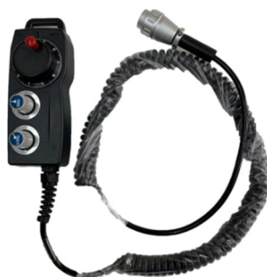
100 Step MPG