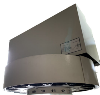
16 Tools Umbrella type ATC