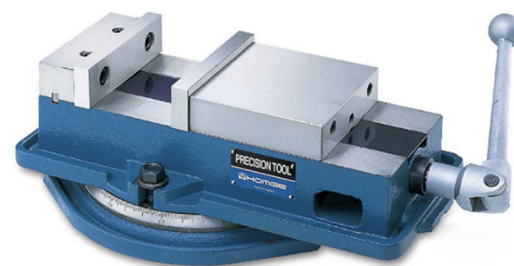
6" Angle Vise HAV-6 (Made in Taiwan)