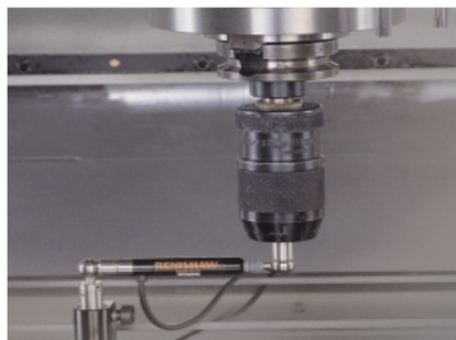
Ball-Bar Testing on every machine

Atrump Proven High Quality Machines and Promoting Centroid Control since 1989