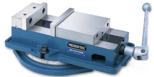
6" Angle Vise HAV-6 (Made in Taiwan)